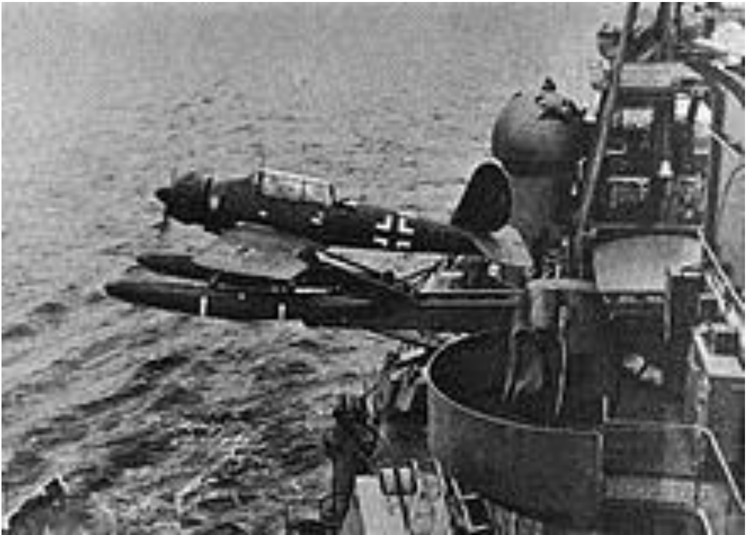
One of Admiral Hipper's three Arado Ar 196 floatplanes being launched in 1942

The first Ar 196 to be captured by the Allies was an example belonging to the German cruiser Admiral Hipper , which was captured in Lyngstad, Eide , by a Norwegian Marinens Flyvebaatfabrikk M.F.11 floatplane of the Trøndelag naval district on 8 April 1940, at the dawn of the Norwegian Campaign . After being towed to Kristiansund by the torpedo boat HNoMS Sild , it was used against its former owners, flying with Norwegian markings. [26] At 03:30 on 18 April, the Ar 196 was evacuated to the UK by a Royal Norwegian Navy Air Service pilot. The aircraft was shortly thereafter crashed by a British pilot while on transit to the Helensburgh naval air base for testing. [27]