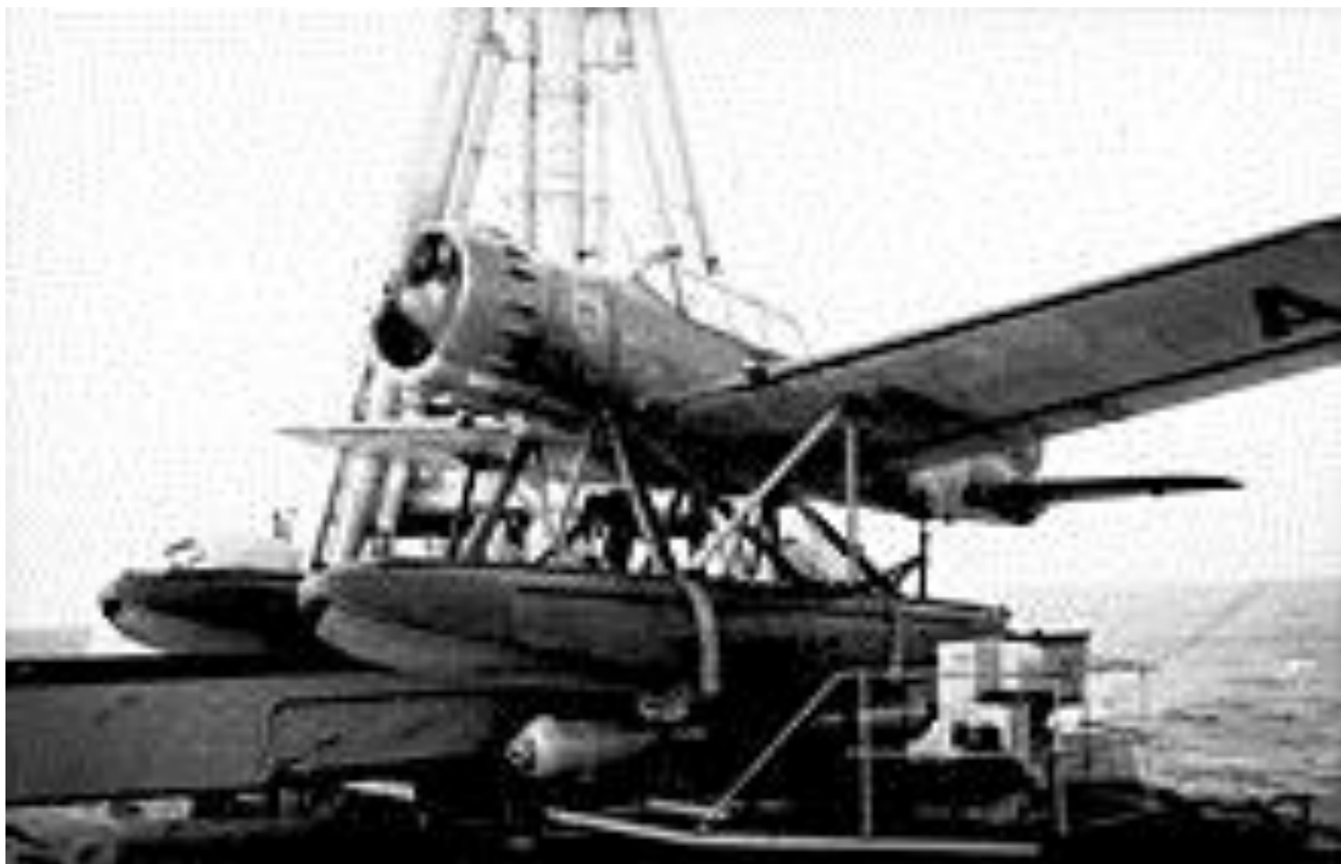
An Ar 196 on board the German cruiser Admiral Hipper

All capital ships of the Kriegsmarine were equipped with Ar 196s: